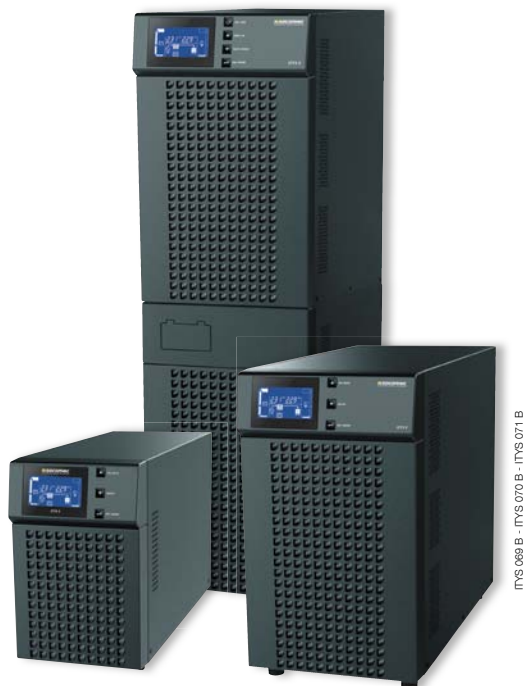
ITYS 069 B - ITYS 070 B - ITYS 071 B